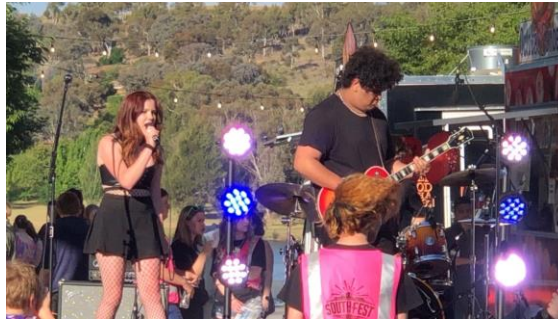
12 young bands and various young performers performed at this youth focused, family friendly event