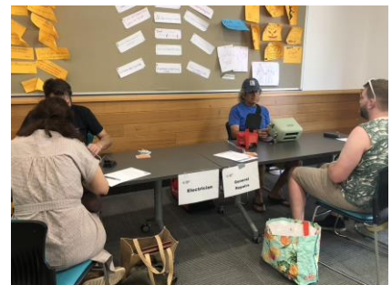
Repair Café in the Library