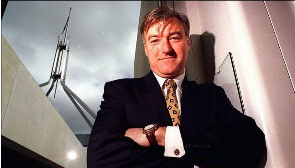
Former Howard Government Aviation Minister John Sharp, says when it comes to airports and residential development we should learn from past mistakes.