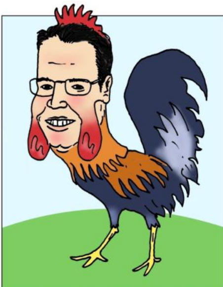
Zed last week