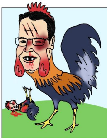
Zed this week