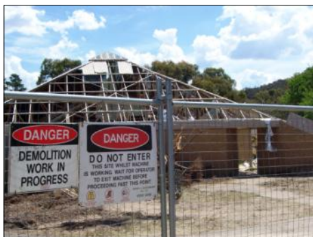
Macarthur Preschool is due to be demolished soon to make way for a childcare centre.

Demolition is expected to begin soon of the old Macarthur Preschool.