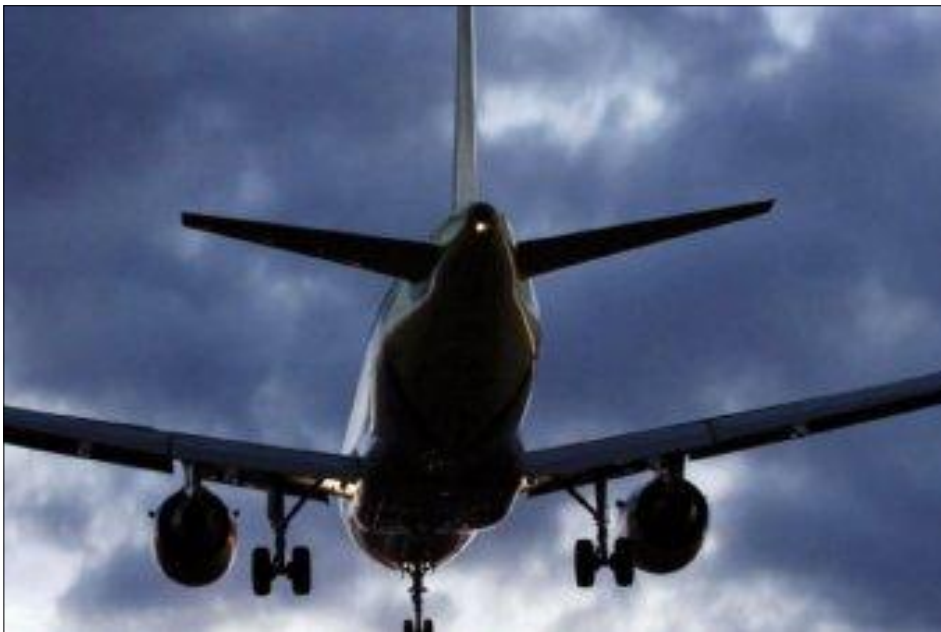
The TCC's long opposition to residential development at Tralee is based on concerns aircraft flight paths will be relocated over parts of Canberra that currently do not suffer from aircraft noise.

The Tuggeranong Community Council (TCC) has received legal advice regarding the planned South Tralee residential development and its possible future impact on Canberra residents.