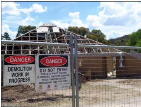
Macarthur Preschool is due to be demolished soon to make way for a childcare centre.

Demolition is expected to begin soon of the old Macarthur Preschool.