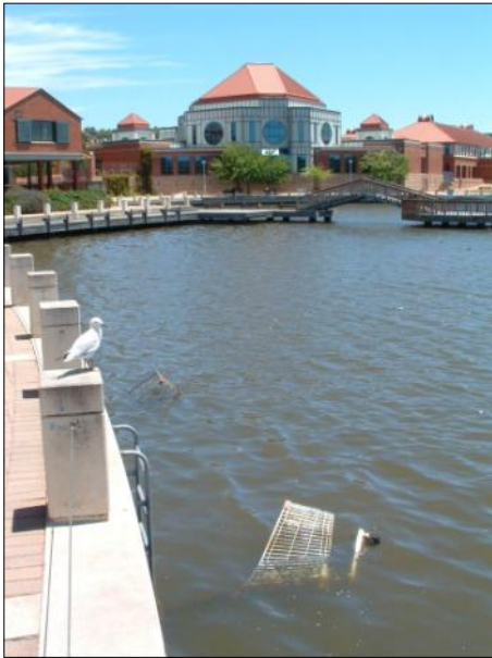
Half emerged shopping trolleys are a regular feature of Lake Tuggeranong.