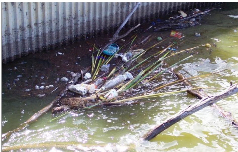
An already sick Lake Tuggeranong has become a garbage dump.

Like other members of the Tuggeranong community, the Southern ACT Catchment Group (SACTCG) has become concerned about the recent outbreaks of blue-green algae in Lake Tuggeranong. The bad smells and unappealing water colour created by the algae make spending time at the Lake less enjoyable for Tuggeranong residents, affecting walkers, picnickers, cyclists and joggers.