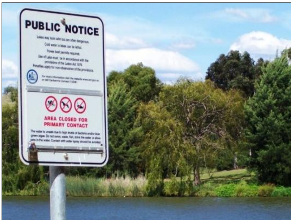
Lake closure notices have become a regular feature around Lake Tuggeranong.

Authorities were warned more than 30-years ago that algal growth would be a problem for Lake Tuggeranong according to a report released by the Southern ACT Catchment Group.