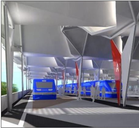
The future HSR station at Canberra Airport

Canberra Airport has unveiled plans for a $140 million high speed rail (HSR) facility to be constructed adjacent to the new airport terminal.