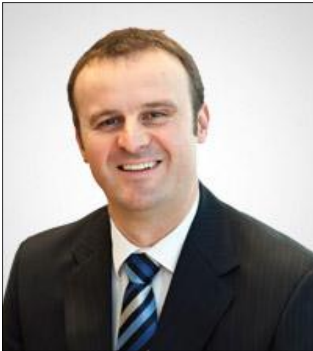
By ACT Treasurer Andrew Barr

The 2012-13 ACT Budget has delivered record funding for frontline services for Tuggeranong residents and provides help for households living on low and middle incomes. The ACT Labor Government is supporting our economy and supporting jobs, which is vital given the Commonwealth is contracting its employment and spending.