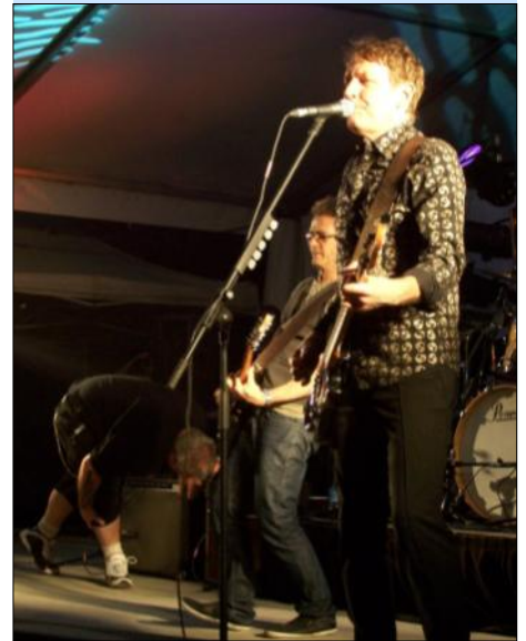
The evening rock concert is one of the highlights of the annual Tuggeranong Festival.

Expressions of interest are now open for on stage performances and stallholders for this year's Tuggeranong Festival.