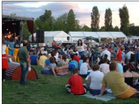
The 2011 Census reports Tuggeranong's population failed to grow in 2011.

Tuggeranong is the only district in the ACT to record no population growth and a small decline in residents according to the latest Census and other data released by the Australian Bureau of Statistics (ABS). The ABS says the 2011 census data shows the population of the ACT increased from just over 324,000 in 2006 to 357,220 in 2011. All districts in the ACT recorded an increase in population except Tuggeranong where there was no growth at all and a small drop in the number of residents from 87,119 in 2006 to 86,900 in 2011, a fall of 219.