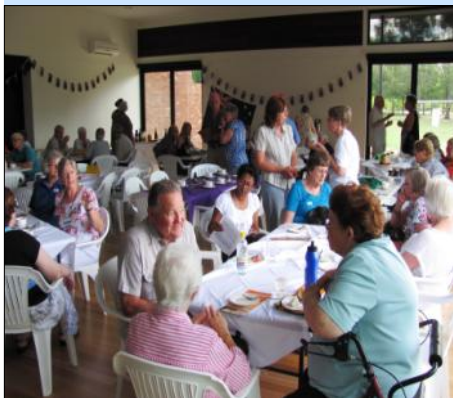
55Plus Club members enjoy the surrounds of their new premises.

The members of the Tuggeranong 55 Plus Club have moved into their new premises on the banks of Lake Tuggeranong and all accounts are that they are thrilled with the new building.