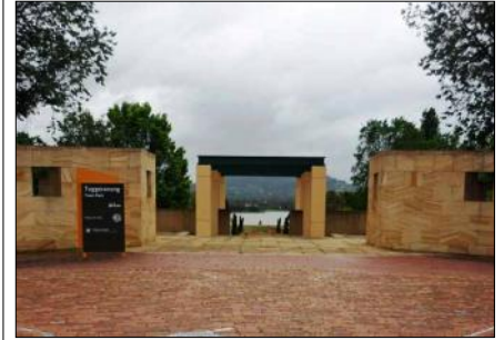
Town Centre Park Entrance

ACT Chief Minister Katy Gallagher today announced that the Tuggeranong Community Festival is among the latest initiatives to benefit from the ACT Government's Centenary Community Initiatives Fund.