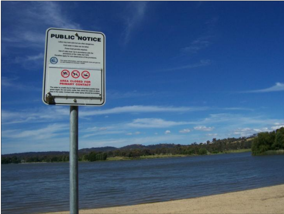
Closure and health warning signs have become a common sight around Lake Tuggeranong.