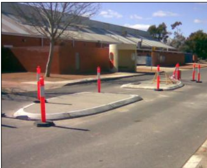
Traffic islands installed in front of the bus stop in Benham Street Chisholm

The Tuggeranong Community Council (TCC) has expressed concerns over traffic flow following the installation of traffic islands.