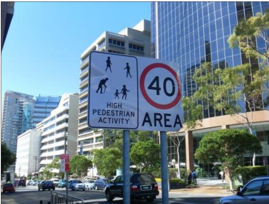
An example of the 40km/h speed limit signage that will be used in the Town Centre

The ACT Government will introduce 40km/h speed limits in the Tuggeranong Town Centre by December 2012.