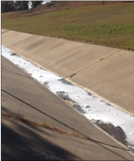
Frothy water flowing down the stormwater channel at Isabella Plains

An Isabella Plains resident has raised concerns over what appears to be soapy water flowing into Lake Tuggeranong.