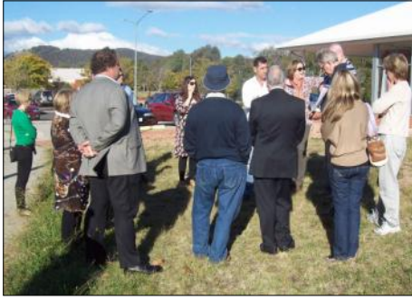
Residents express concerns over a proposed development near Chisholm shops at an onsite meeting.

Two planned developments in Chisholm have recently come under the community spotlight.