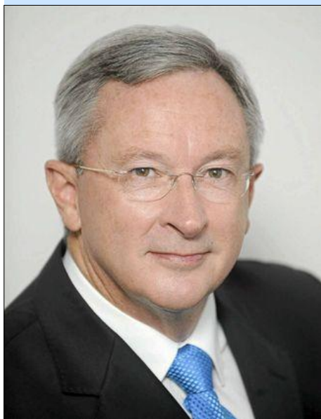
NSW Minister for Planning and Infrastructure, Hon Brad Hazzard MP

NSW Minister for Planning and Infrastructure, Brad Hazzard, has postponed making a decision on South Tralee.