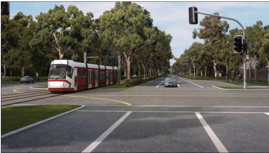
An artist's impression on light rail in Northbourne Avenue

ACT Light Rail has questioned costings to link Gungahlin to Civic with a light rail system. A report into public transport options released recently by the ACT Government suggests a light rail line from Gungahlin and Canberra's city centre would take at least five years to plan and build and cost up to $860 million.